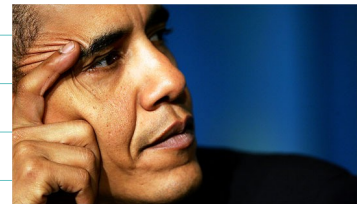
The Future President?

Undecided: 18 Barack Obama: 11 Rudy Giuliani: 8 Hillary Clinton: 4 John McCain: 2