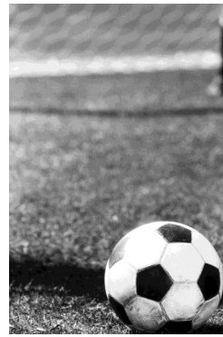
The Badgers are bringing experience and passion to the field this year.