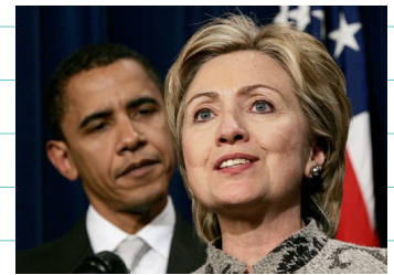
It's a close race for these two candidates.